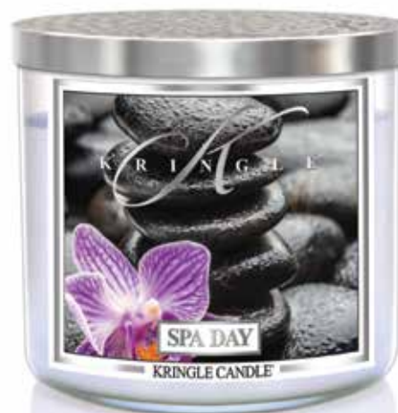
944 • SPA DAY Let's have a Spa Day and be cooler than a cucumber adding a mix of mint and apple to set the mood.

3 Wick 14 OZ, REUSABLE JAR $26.00 PER CANDLE