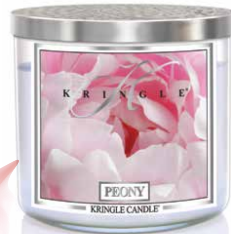
943 • PEONY Notoriously difficult to replicate, we've found the delightful sweet and lively essence of these lavish pink blossoms.