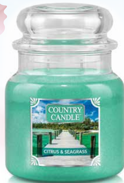
972 • CITRUS & SEAGRASS A blend of mandarin, grapefruit, mint, cedarwood, and musk that will put you atop the highest sand dune, kissed by the ocean breeze.