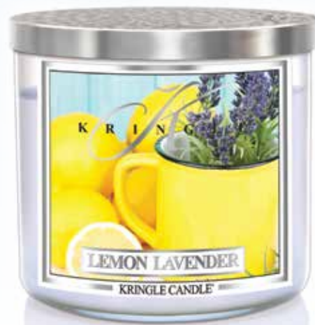
942 • LEMON LAVENDER Two powerhouse scents that play well together. Bright, luscious lemon meets lavish lavender.