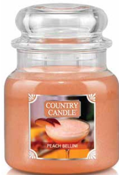
971 • PEACH BELLINI This refreshing cocktail creation is just the right mix of effervescence and perfect peaches.

Shop on line to support your organization! MEADOWFARMS.COM