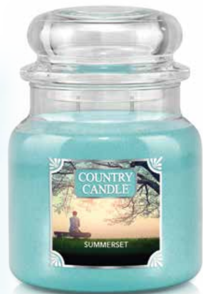
968 • SUMMERSET The ultimate combination of sweet pear, smoky sandalwood, amber and creamy vanilla that will soothe and relax the soul.

Our Country Medium size jar candle is perfect for small to mid-size rooms in your home and for every occasion. Features include our multicolor paraffin wax, easy-peel label, reusable jars for storage containers & recyclable. Clean, long burning (up to 65 to 90 hours) with 100% natural cotton fiber blend wicks. Highly fragrant lasting the life of the candle. 4"W x 5"H