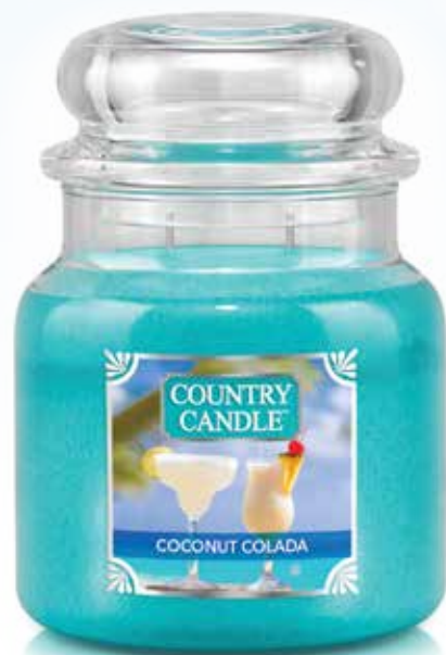
966 • COCONUT COLADA It's Pina Colada but with coconut shaken just right!

2 Wick 16 OZ, APOTHECARY JAR $26.00 PER CANDLE