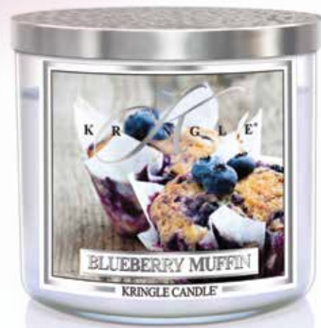
941 • BLUEBERRY MUFFIN Baked blueberries yield a luscious, fruity scent totally different from the fresh fruit. It's matched perfectly with a warm cake note.